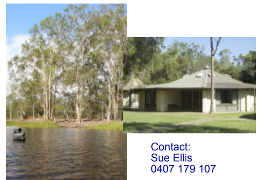
2020 Pilgrimage Kindilan Retreat