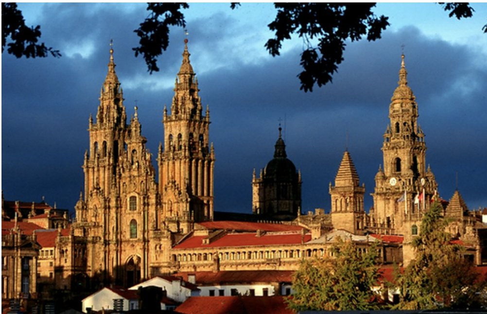
Shrine of St James, Santiago de Compostela – Spiritual Homeland of Cursillo

Those who first developed the Cursillo Movement worked together as a team from the very beginning. They worked as a leaders' team that prayed together, shared their Christian lives together, studied together, planned together, acted together and evaluated what they had done together. Together they worked at the task of forming Christian life among the young people of Majorca. Out of their common efforts, something new in the life of the Church was born.